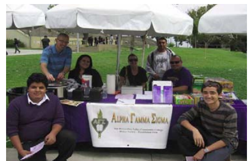
Alpha Gamma Sigma