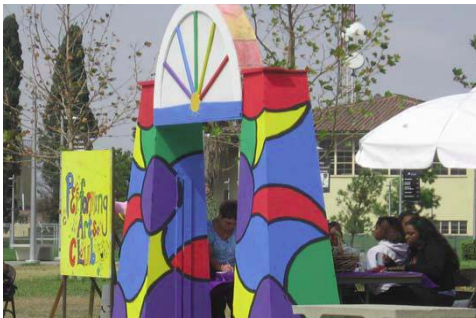
Performing Arts Club