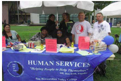
Human Services Club